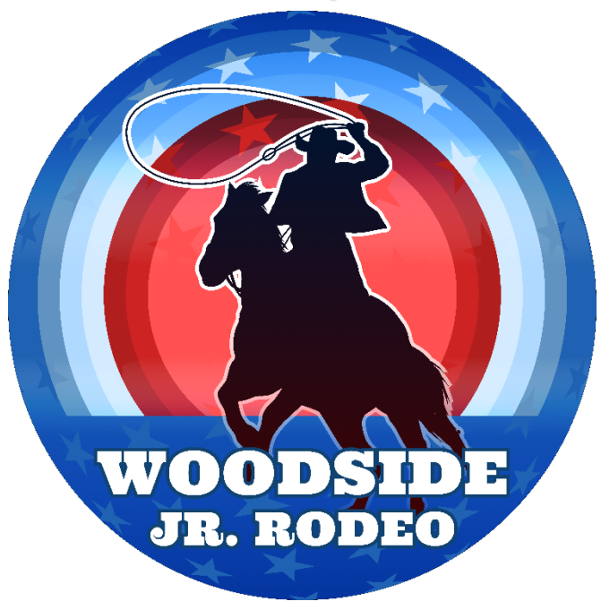
Presented by the Mounted Patrol of San Mateo County